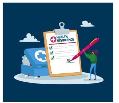
3. Original of the Health Insurance Contract and Card of the Insured person (we highly recommend students to take copies of the Contract and the Card).